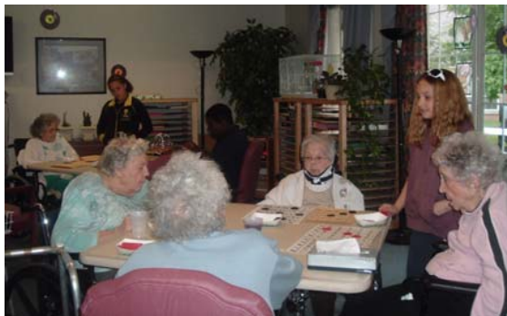
(right) Club members assist with games during a recent visit with residents of Parkvue Nursing Home.

Club Members have been very busy doing community service projects both in the Club and in the community. A group visited Parkvue Nursing Home and we had 8 members involved with Make a Difference Day. They interacted with residents at Ohio Veteran’s Home. Our Torch Club, Young People – Willing Workers , continued to help keep the Wightman/Wieber Park clean and we always enjoy assisting the Church congregation with their spaghetti dinner.