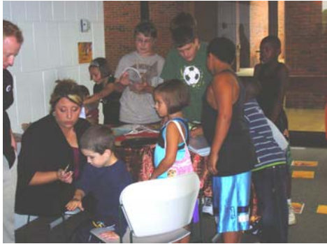
(left) Club members wait in line for tattoos as they wait for the play to begin.

BGSU Firelands and Caryl Crane Theatre invited members to an evening of art and artistry. Members got tattoos, face paint or caricatures, and did an art project while awaiting opening night at Caryl Crane Theatre. The theatre was packed as members and guests enjoyed opening night of “ The Wizard of Oz. ” Each child in attendance received at least 3 books from Firelands First Book .